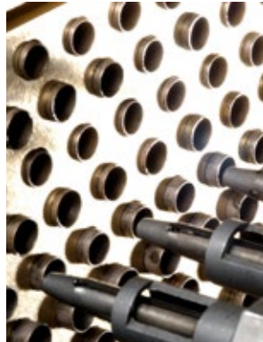
Recoiling of a closed circuit cooler is one of the most effective and easiest ways to get your heat exchanger running smoothly again.

Closed circuit coolers often come into contact with substances, such as oil, salts and condensates, which can corrode or erode the fins, coatings and tubes. Pollutants can also enter open water cooling circuits, leading to an accumulation of deposits that can block the tubes and cause leaks from the joints and seals. Kelvion will recoil the coolers with new inserts, using the latest modifications and materials, to allow optimum efficiency and reliability.